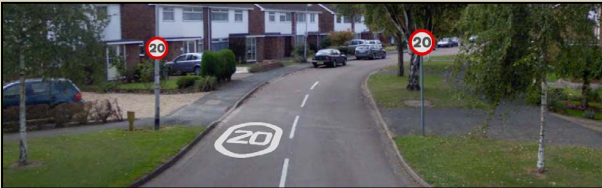
Example of how entry into the proposed limit on a smaller road could look: a 20mph 'roundel' road marking and 20mph limit signs.