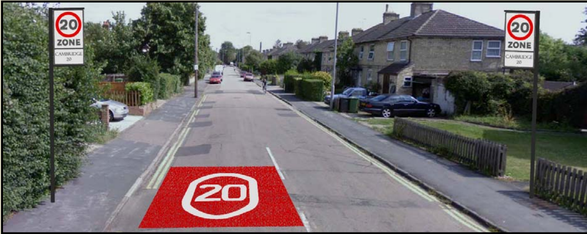
Example of how entry into the proposed 20mph on a main road could look: a 20mph 'roundel' road marking with coloured road surface and two 20mph Zone entry signs.